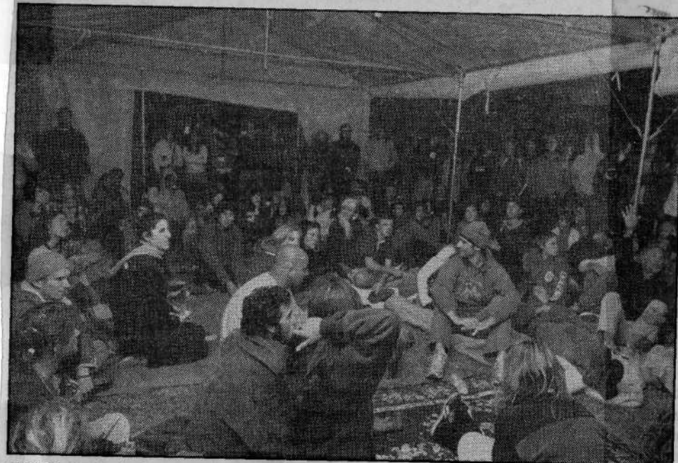
UCSC students democratically decide to spend the night at their Tent University despite the threats of university officials to send in the police.