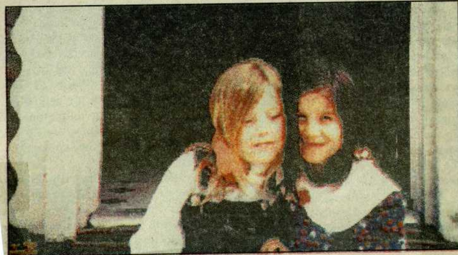
Children in the Beach Flats neighborhood. The area has the last large concentration of affordable housing for low-income families in the city.

If speculators were surprised at the magnitude of community opposition this time, they may face an even bigger shock when protesters occupy the Tidelands property and demand its retention by the city. Real alternatives, like utilizing eminent domain proce-